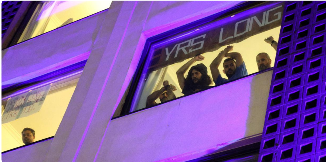
People standing in a window gesture towards pro-refugee protestors demonstrating outside the Park Hotel, where Serbian tennis player Novak Djokovic is believed to be held