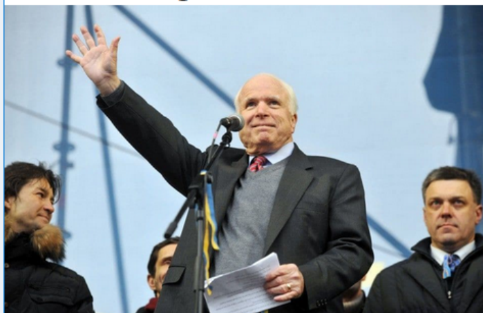
Sen. John McCain (R-Ariz.) waves to protesters during a mass rally of the opposition in Kiev, Ukraine, on Dec. 15, 2013.